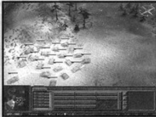
FIG. 3-4 I used this force to wipe out the UCS army. A couple of upgraded 105-mm cannon tanks and rocket launcher-equipped vehicles gather to move south and crush the enemy.

Once you've completed the learning steps, you will be alerted to the presence of enemy units on the map (even if you search the entire map before this point, you won't encounter enemy units until you have five Pamir tanks). A small UCS force lies southwest of your base. To defeat it, you must build a large number of Pamir tanks with 105mm cannons. As soon as it becomes available, build a Research Center and start working on the rocket launcher and 105mm cannon upgrade (double gun). You'll need a lot of firepower to slice your way through UCS forces. The more improved units you can bring to the battlefield the better. To get through this mission more quickly, build a second Weapons Production Center to increase production of offensive units.