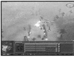
FIG. 3-3 A scout force of Pamir tanks stumbles up on UCS forces southwest of your base. You'll need to upgrade some units to wipe out this force.

Once you've completed the learning steps, you will be alerted to the presence of enemy units on the map (even if you search the entire map before this point, you won't encounter enemy units until you have five Pamir tanks). A small UCS force lies southwest of your base. To defeat it, you must build a large number of Pamir tanks with 105mm cannons. As soon as it becomes available, build a Research Center and start working on the rocket launcher and 105mm cannon upgrade (double gun). You'll need a lot of firepower to slice your way through UCS forces. The more improved units you can bring to the battlefield the better. To get through this mission more quickly, build a second Weapons Production Center to increase production of offensive units.